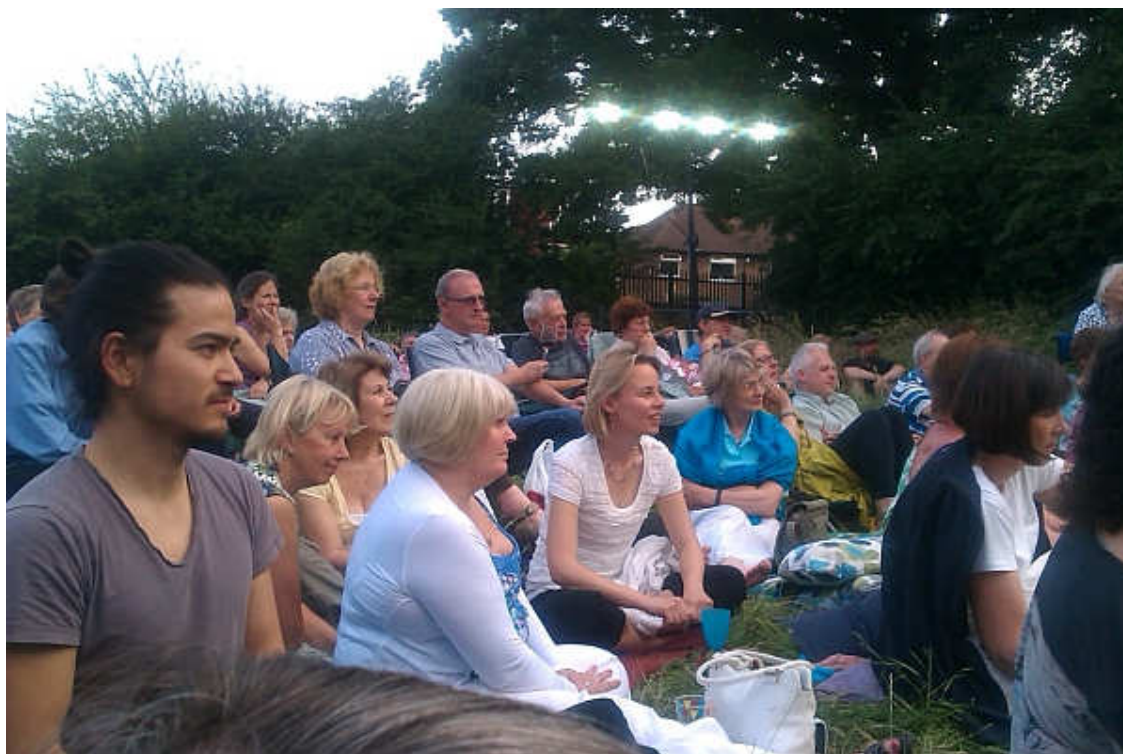
A captivated audience during "Beyond the Veil"