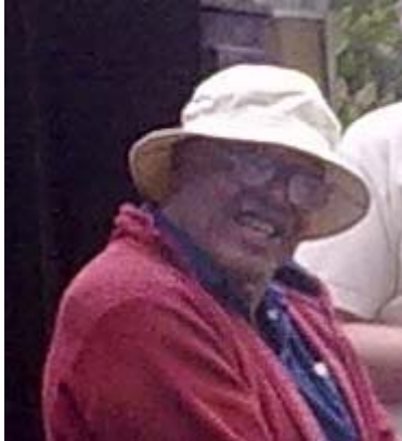
Rest in Peace, Friend, and thank you for all you did!

unwell and so not able to visit and work at the Wood for some years - this photo caught him on what was probably his last visit to the Reserve, a Field Meeting in 2010.